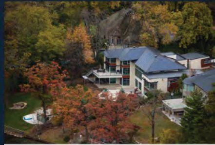
Bloomfield Hills, MI