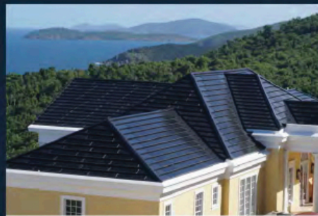
St. Thomas, U.S. Virgin Islands